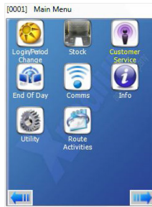
Daily activities can all be accessed from the Main Menu.

In addition, while many feature requirements are common across operations, the Xpedium solution can accommodate and scale across the operational nuances of Over-The-Road Carriers, LTL, and Local or Regional Delivery. The .Net architecture also allows the effective use of a wide range of mobile devices ranging from smart phones to industrial grade PDA-type handhelds providing the right fit of technology and at the right price.